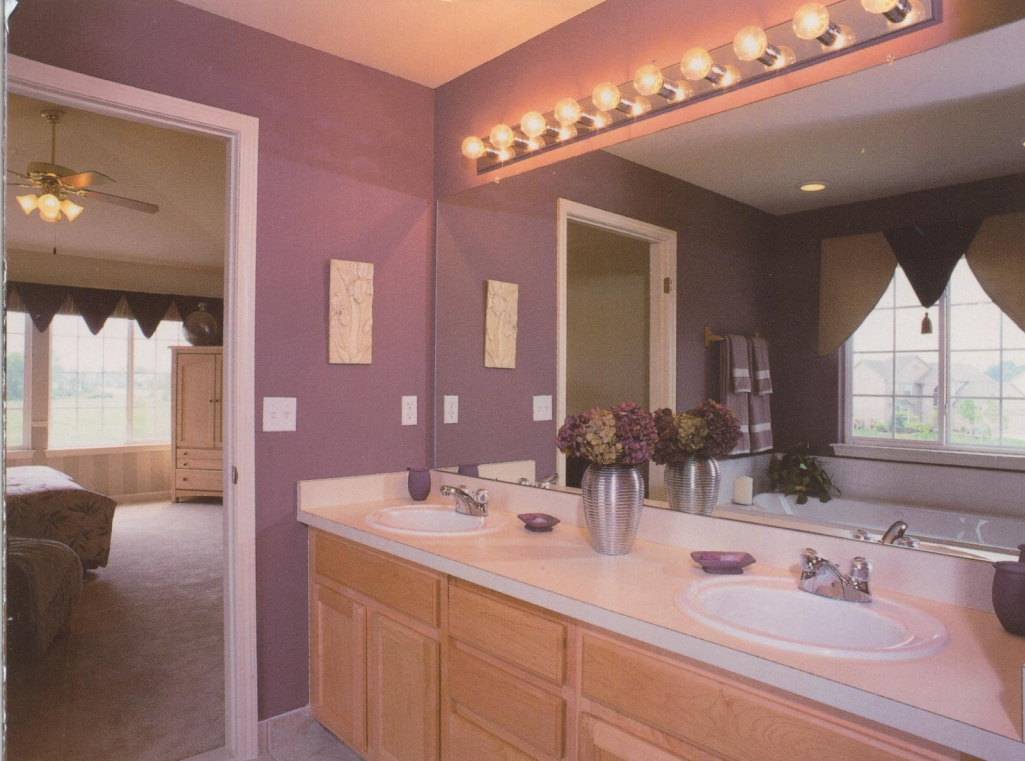
The master bedroom and bath of the Raleigh II provide the spacious and relaxing atmosphere so many homeowners desire. A cathedral ceiling and oversized walk-in closet accent the bedroom, while the bath provides twin sinks, a whirlpool tub, separate shower and ceramic floor tile.

Hickory Woods in Van Buren Township. The company also has a new community underway, Elliot Farms in Ypsilanti, where approximately 200 home sites are in the early stage of development.