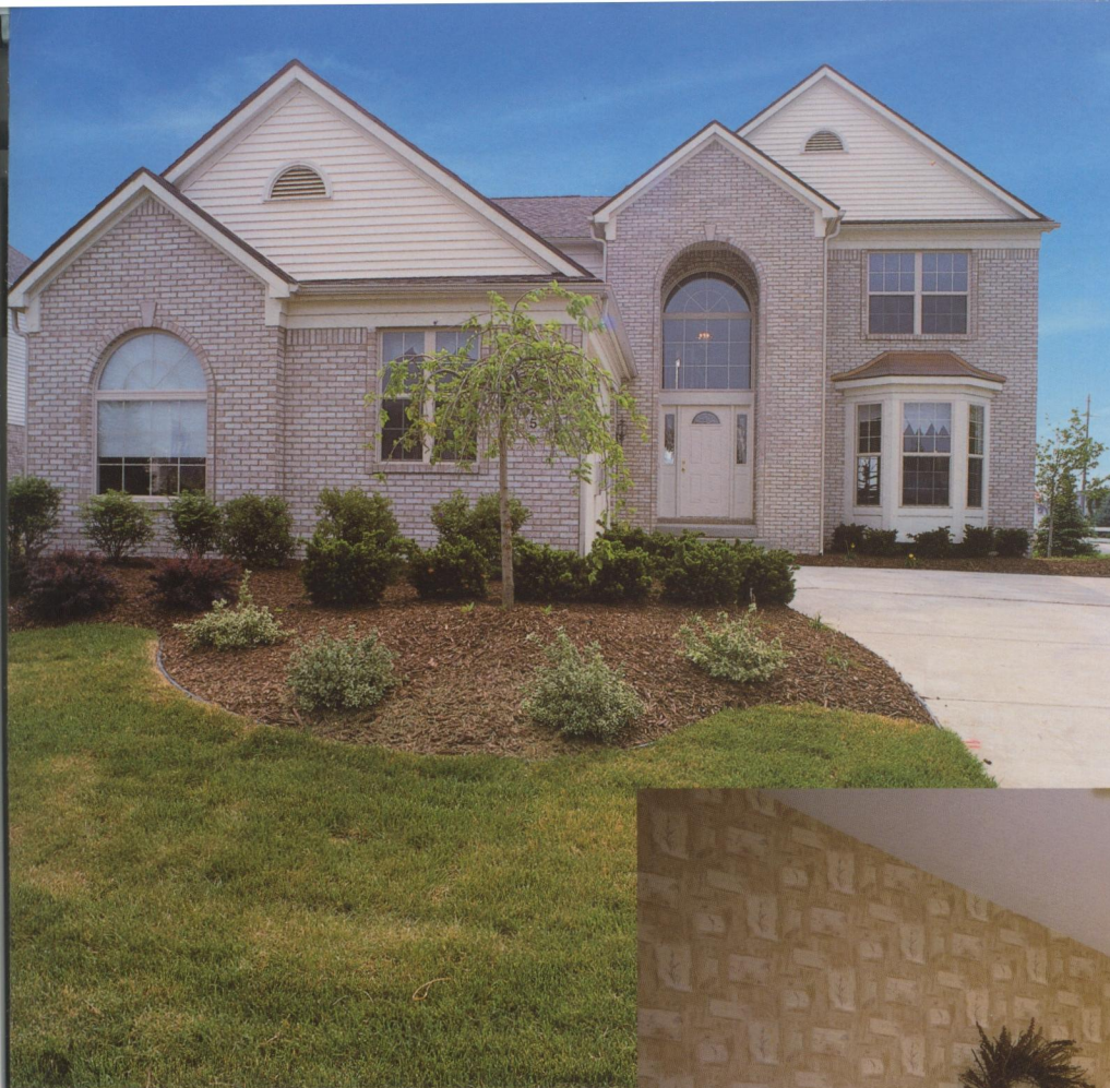
One of RDK Homes' popular models, the Merrimack II design offers 2,700 square feet of living space and includes a courtyard side entry garage and a full brick exterior.