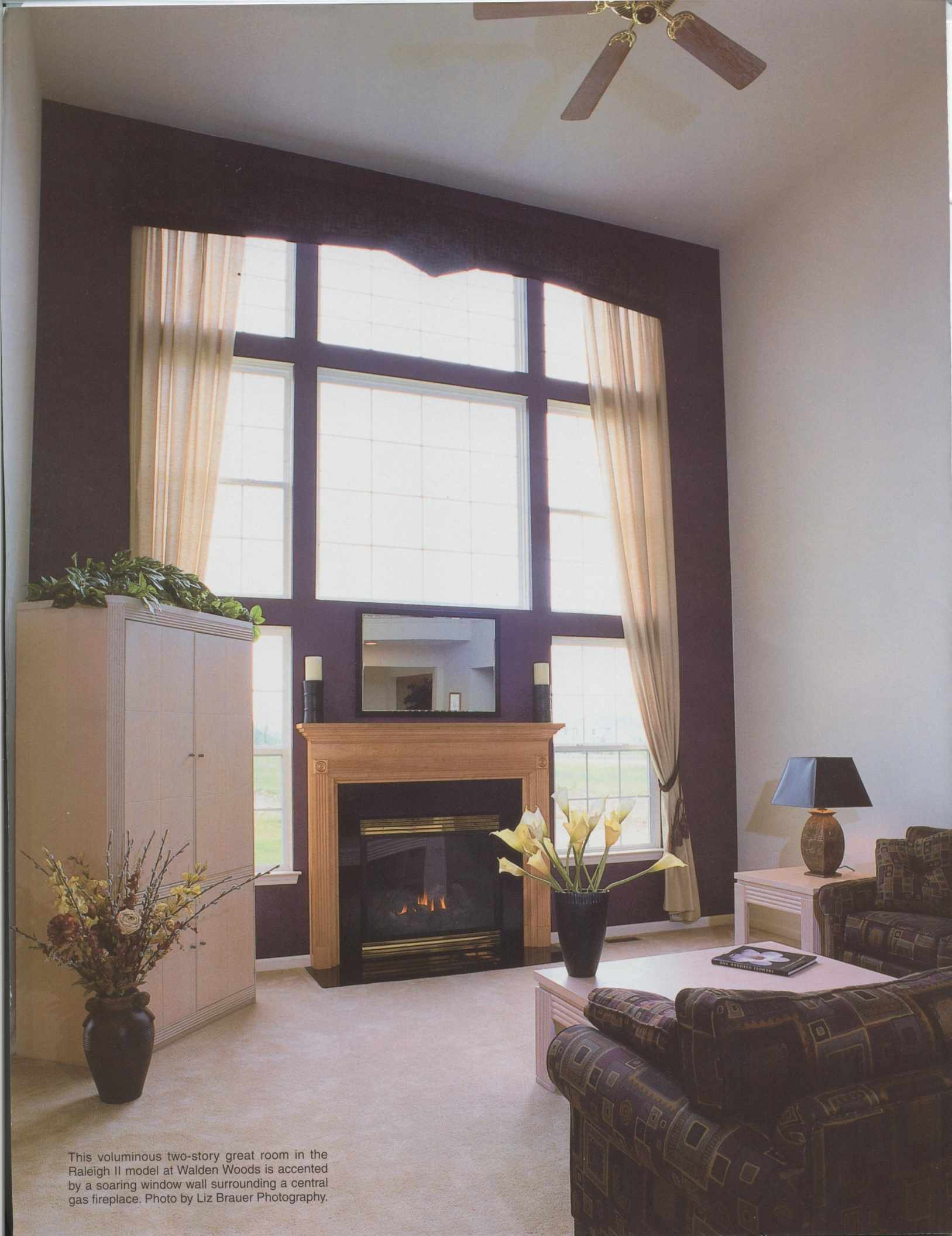
This voluminous two-story great room in the Raleigh II model at Walden Woods is accented by a soaring window wall surrounding a central gas fireplace.